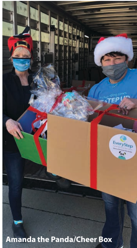
Amanda the Panda/Cheer Box