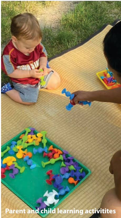
Parent and child learning activities

1st Five - Healthy Mental Development 5-2-1-0 Adopt-A-Family Amanda the Panda Biometric & Wellness Screenings Care for Kids - EPSDT Child Care Nurse Consultant (CCNC) Program Correctly Compliant Program Children at Home Community Home Visitation Connections Contract RN Correctional Facilities 5th Judicial DNA Collection Drake University Head Start Nurse Consultation FathersMatter Flu Vaccination Clinics Grief & Loss Services Healthy Homes Iowa Healthy Start & Empowerment Home Care Hospice Interpretation Refugee Immigrant Guide Program Iowa Family Support Network I-Smile™/Dental Voucher Maternal Child Health Outreach Nine2Thrive™ Nurse Family Partnership Palliative Care Play & Learn Senior Companion Senior Health Stork's Nest/Family Nest StoryBook Project